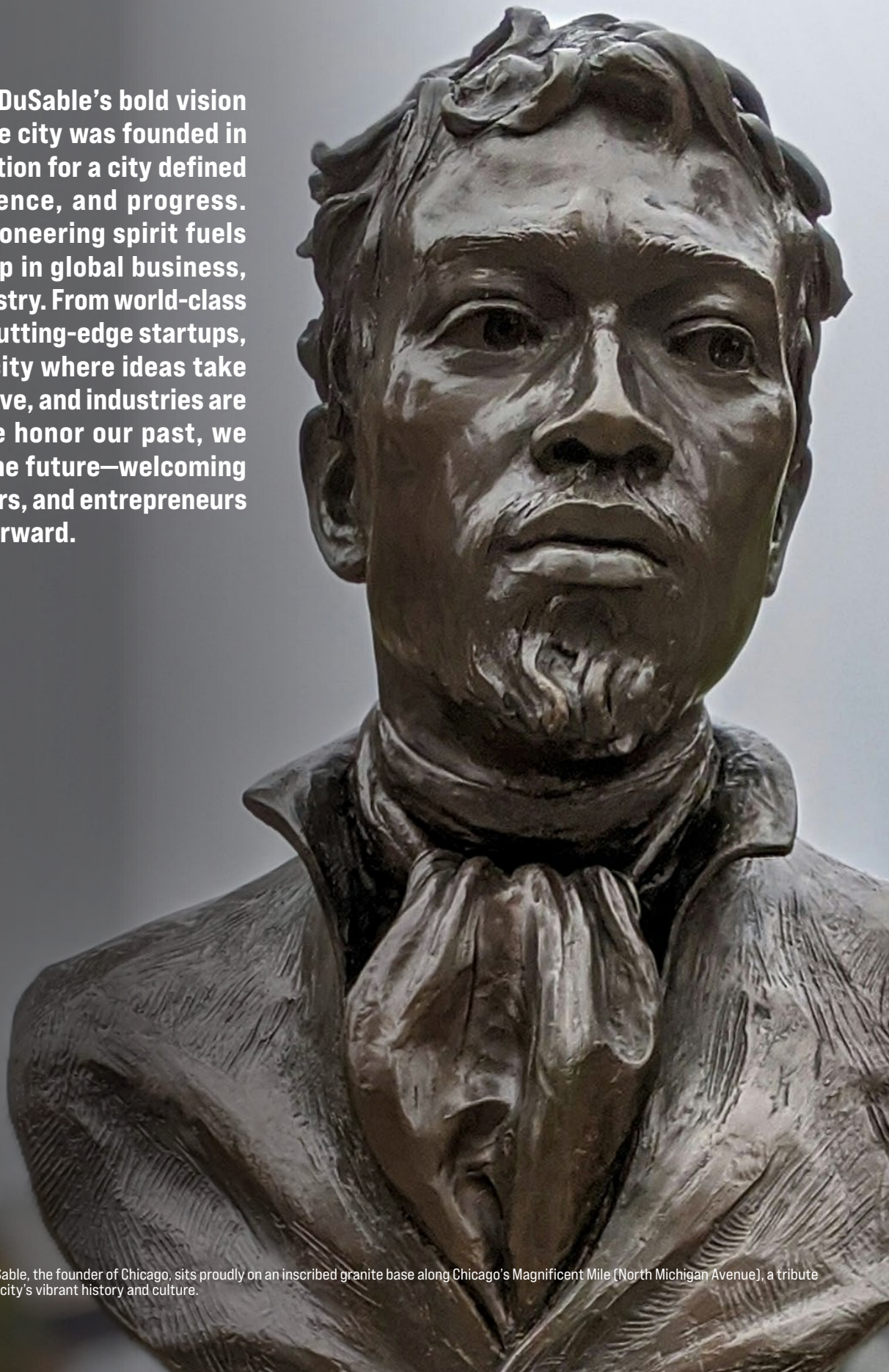
A bronze bust of Jean Baptiste Point DuSable, the founder of Chicago, sits proudly on an inscribed granite base along Chicago’s Magnificent Mile (North Michigan Avenue), a tribute to the pioneering spirit that shaped the city’s vibrant history and culture.

Jean Baptiste Point DuSable’s bold vision for Chicago when the city was founded in 1837 laid the foundation for a city defined by ambition, resilience, and progress. Today, that same pioneering spirit fuels Chicago’s leadership in global business, technology, and industry. From world-class innovation hubs to cutting-edge startups, Chicago remains a city where ideas take root, businesses thrive, and industries are transformed. As we honor our past, we continue to shape the future—welcoming bold thinkers, builders, and entrepreneurs who drive the city forward.