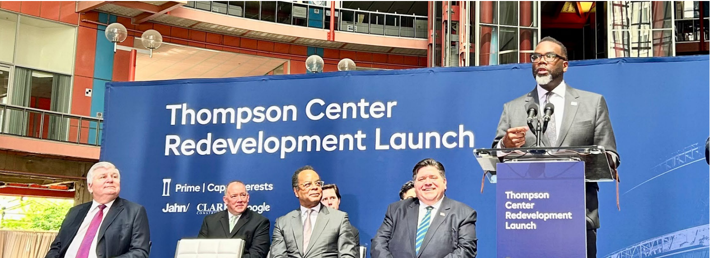
Google breaks ground on transforming the iconic Thompson Center into its new Midwest headquarters, further cementing Chicago as a hub for tech innovation. (April 2024)